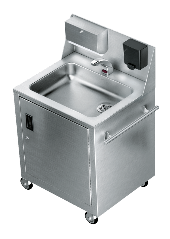
Note: Minor assembly of accessories required